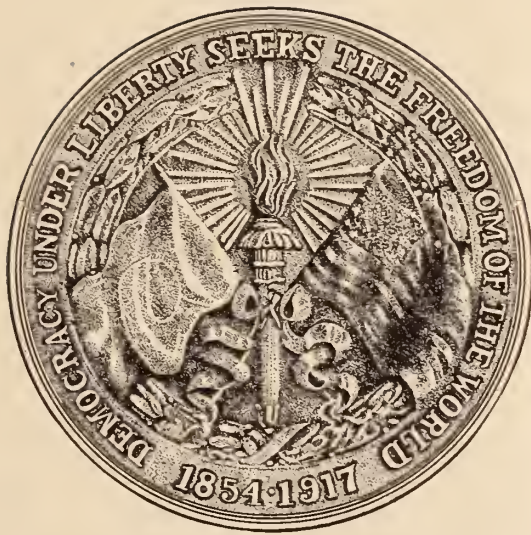
GOLD MEDAL PRESENTED BY THE CITY OF BOSTON TO VISCOUNT ISHII